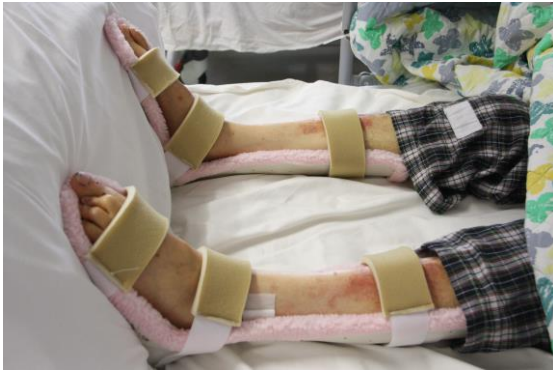
Figure 4: Foot splints