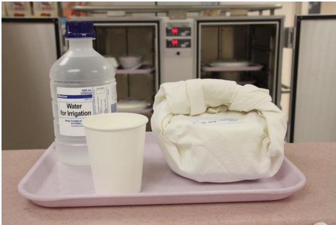
Figure 1: Post liver transplant clean diet and water

After the operation, doctors will advise you to resume a regular diet as soon as possible to obtain adequate nutrition. When you first resume diet, you will experience loss of appetite, nausea, flatulence, or even vomiting. This is probably because the residual effects of anesthesia and slow bowel movement after the surgery. You will recover in a few days and your appetite will gradually improve. We recommend you to reduce the regular meal size and eat between regular meals. Do not get too full and avoid taking a lot of liquid before and after meals. The nurse will arrange you clean diet and drinking water, see figure 1, so family does not need to bring you food. Dietitian will also see you and design the postoperative eating plan.