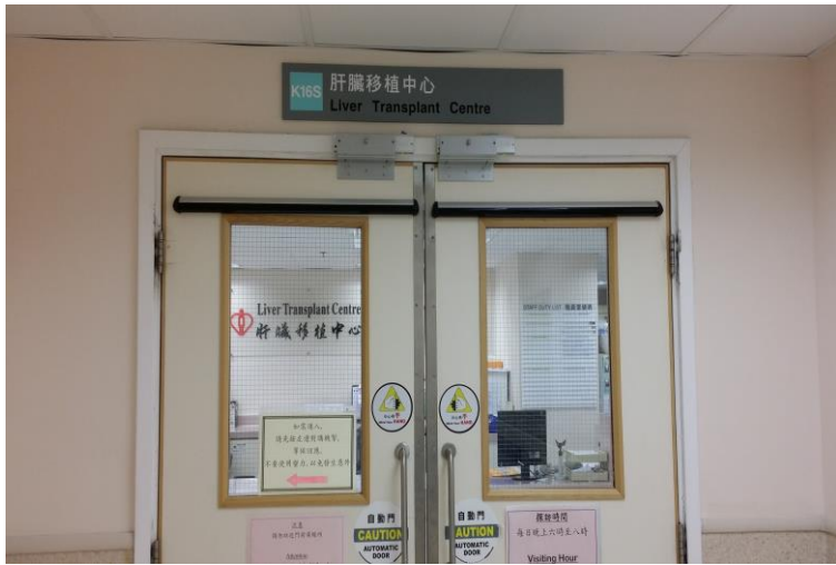
Liver Transplant Centre