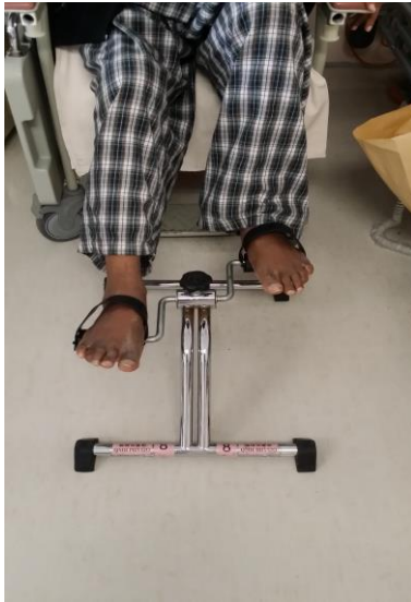
Figure 3: Bike: for limb exercise