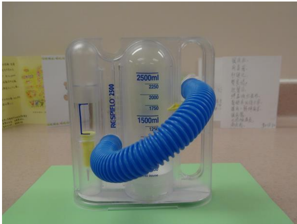
Figure 2: Breathing exerciser

Apart from obtaining sufficient nutrition and taking medications at specific times, mild exercise is essential for recovery. In the first few days after surgery, you should get out of bed and sit on chair for at least 1-2 hours every day. Please do more deep breathing exercise because it helps your lungs to expand and enables you to cough up sputum easily or use your self-financed breathing exerciser (see figure 2).